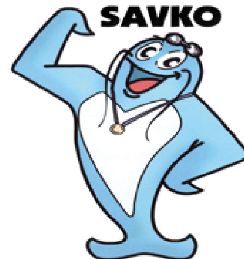
MASCOT OF SABAC MARATHON

COMPETITIVE MAP ROUTE RIVER SAVA - 19 km